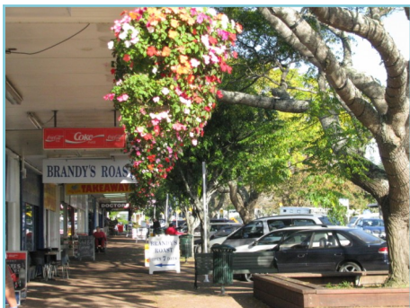
The Village Shops is part of our Patrol Area

The Mangere Bridge Volunteer Community Patrol has been patrolling the streets of our beautiful suburb since October 1998. Our purpose has been to be the eyes and ears of the Police and our community. Our aim is, by our presence, to help reduce crime and make our community a safer place to live. At the end of May 2010 we launched a new initiative. In addition to the very successful Car Patrol we have established a Foot Patrol. This has been a great success. We would very much like to grow the Foot Patrol and put more patrols out on the Village streets. To do this we need more volunteers.